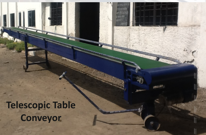
Telescopic Table Conveyor