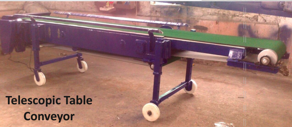
Telescopic Table Conveyor